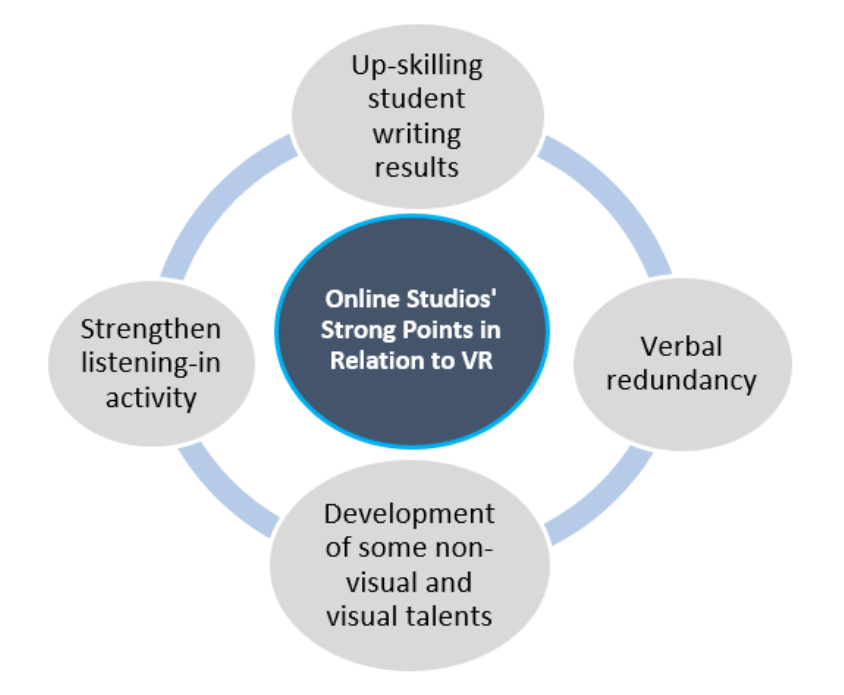
Fig. 1: A conceptual model of the advantages of online studios for VR